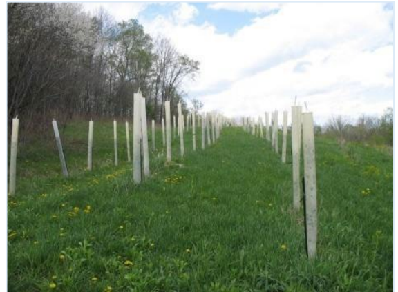
Trees in protective plastic tubes

General Planning Considerations – County-level programs are often aligned with work being done by the Minnesota Department of Natural Resources, using easements and other conservation practices to protect wildlife and water quality. Unlike more traditional agricultural easements, working forests easements allow landowners to continue to harvest and manage their timber under an approved Forest Stewardship Plan .