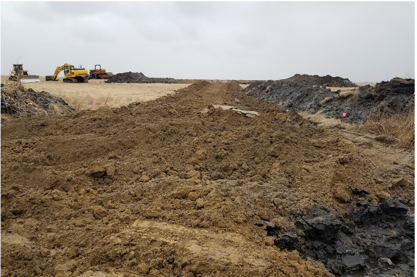
A contractor installs a ditch plug, which blocks the ditch, allowing water to fill the once-drained wetland. The wetland restoration project in Becker County required several ditch plugs.