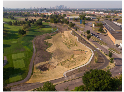
Previously untreated runoff from 612 acres now flows from east to west through Columbia Golf Course and Columbia Park, where it is diverted to a treatment pond, a dry basin, and then an infiltration basin before it re-enters the stormwater sewer system and continues on for 1.2 miles to the Mississippi River. The Clean Water Fund-supported project is slated to wrap up this month.

Minneapolis’ public works, parks play vital roles in a $7.4 million project designed to produce cleaner stormwater; create habitat with native plants and trees; curb flooding in Columbia Golf Course, surrounding neighborhood