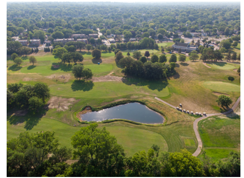
Work started in October 2020. Construction was coordinated with planned street improvements to save money and minimize traffic disruptions in the neighborhood. Restoration and planting followed storm sewer replacement and grading.

the summer. Coordinating construction with planned street improvements cut costs and minimized traffic disruptions.