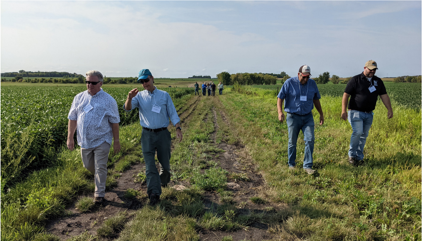
Board tour attendees visit a property in Mower County's Dexter Township to view a water control structure. The dam was the third stop on the Aug. 25 tour, which featured 13 conservation projects in Mower and Freeborn counties.