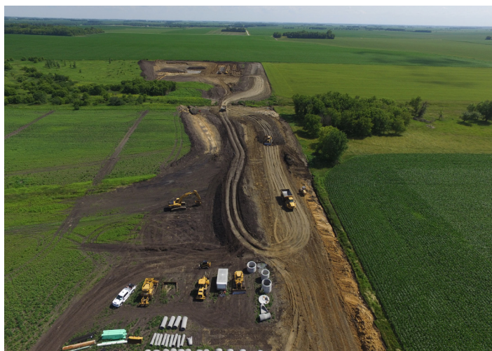
BWSR Board tour attendees visited a water storage structure in Mower County's Dexter Township (shown under construction above). The completed project (below) is estimated to reduce phosphorus by 194 pounds per year and total suspended solids by 126 tons.