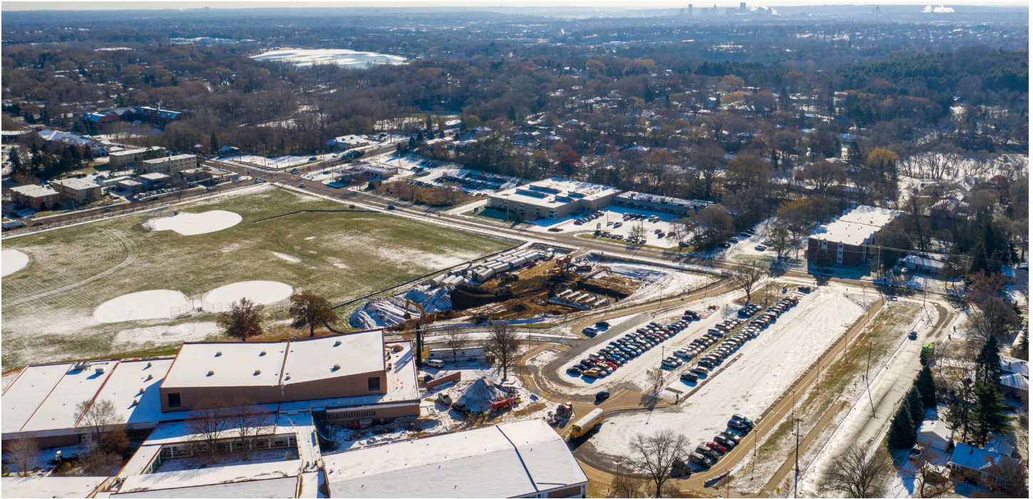
Above: Stormwater from a 46-acre watershed drains to the Ramsey County Road B storm sewer adjacent to Parkview Center School in Roseville. Now cleaned water treated at the site discharges through the storm sewer and runs through wetlands at Villa Park before entering Lake McCarrons. Below: Original plans called for siting the project under school athletic fields. But groundwater was too close to the surface there, so it was worked into a hillside.

“Unless there was a sign there, you wouldn’t even know,” said Todd Lieser, Roseville Area Schools supervisor of buildings and grounds, who was involved from design through completion. The temporary signs installed during construction were to be replaced by permanent educational signs.