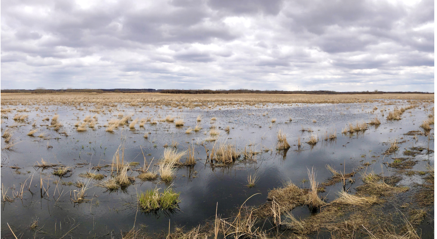
A wetland banking project in Becker County restored 80 acres of wetlands and more than 63 acres of upland habitat. The wet meadow shown above is one of three wetlands restored during construction, which began in October 2020 and concluded in November.