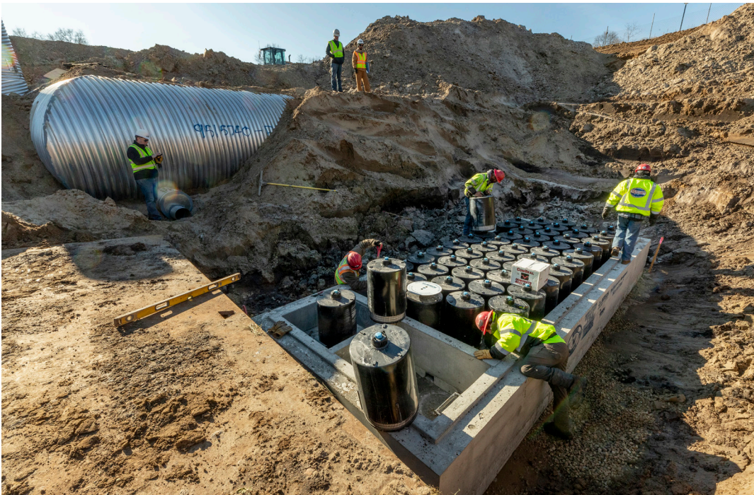
Water stored in the underground pipes is released within 48 hours by passing through an innovative filtration system: a concrete tank with 53 filter cartridges containing volcanic rock modified to chemically remove dissolved phosphorus.