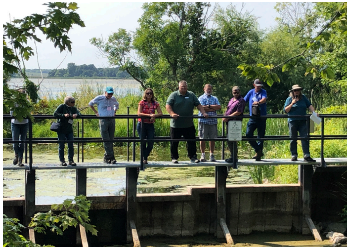
Board tour attendees view an outlet structure at Geneva Lake in Freeborn County.

“We’re putting these easements on properties that are not the most productive, but they are environmentally sensitive,”