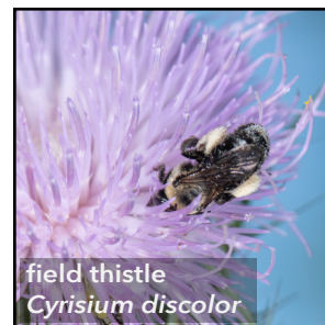
field thistle Cirsium discolor