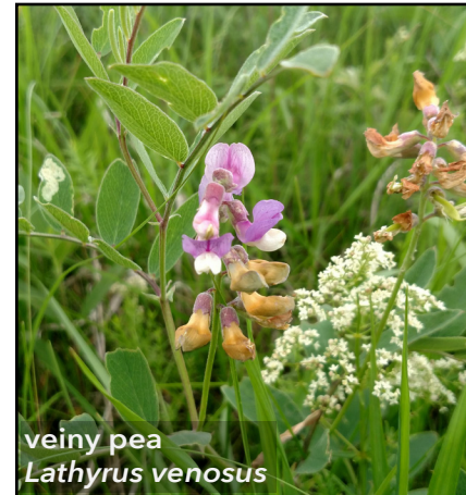
veiny pea Lathyrus venosus

Early blooming flowers are critical to bee conservation. However, early blooming plants are notoriously difficult to source and establish in prairie reconstructions. A number of bee species are active only in the spring. Spring is also when bumble bee queens are emerging and establishing colonies. This can be one of the most sensitive times in colony development, as the queen must establish and provision a nest without assistance of the workers that will follow later in the year. Stresses at this time of the year could be particularly disastrous for bumble bee populations.