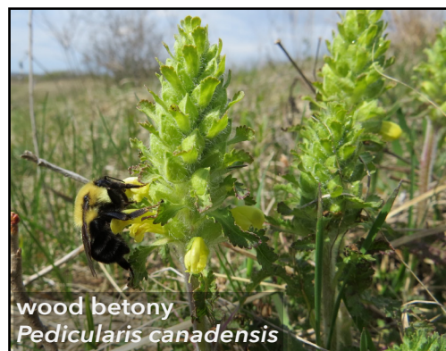
wood betony Pedicularis canadensis