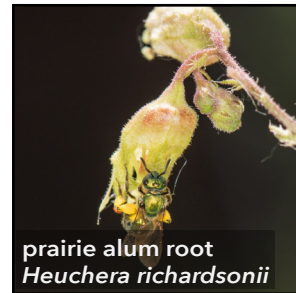
prairie alum root Heuchera richardsonii