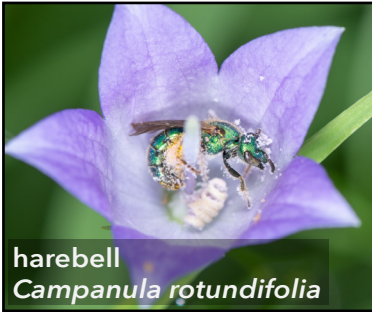
harebell Campanula rotundifolia

Forb diversity is one of the best predictors of bee community diversity. The vast majority of flowering plants used in restorations come from only three plant families: asters (Asteraceae), mints (Lamiaceae), and legumes (Fabaceae). We know that other plant families can be particularly attractive to bees, especially the rose (Rosaceae) and bellflower (Campanulaceae) families. Below are species that represent these important families and are known to be attractive to bees.