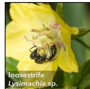
loosestrife Lysimachia sp.