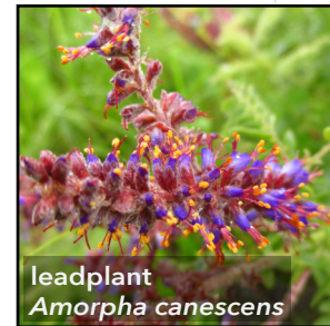
leadplant Amorpha canescens