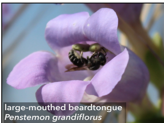
large-mouthed beardtongue Penstemon grandiflorus