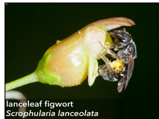
lanceleaf figwort Scrophularia lanceolata