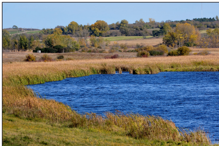
A gap in the cattails, at center, indicates where Outlet Creek enters Lake Emily. With a series of Minnesota Board of Water and Soil Resources-funded projects in the watershed, Pope SWCD aims to cut the phosphorus load entering the shallow lake.

water quality goals would require cutting its annual phosphorus load by 35 percent – or 6,370 pounds. The 74 projects outlined in the 2016 and 2017 CWF grant applications would meet an estimated 98 percent of the Total Maximum Daily Load goal.