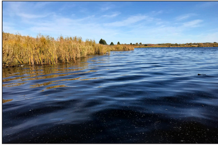
Lake Emily, seen here with cattail fuzz resting on the surface, is impaired for nutrients. Outlet Creek connects it to Lake Minnewaska 6 miles to the northeast.