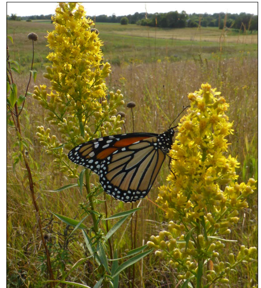
A variety of strategies can help protect plantings from pesticides, including spatial buffers, changes in cropping systems, and reductions in pesticide use.