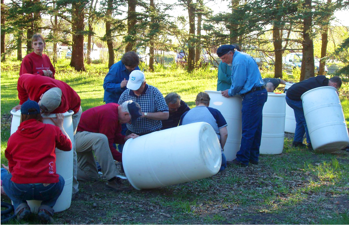
Left: Rain barrel-making workshops are among the ways the Clay Soil & Water Conservation District is reaching an audience through its Urban Conservation Program.