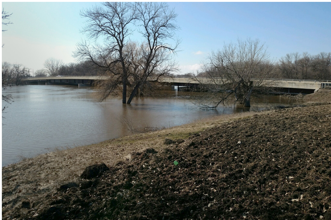
A Pollinator Pint Night raised funds for signs that will mark an 8-acre pollinator project on the Red River. The site just south of Moorhead city limits was tilled and ready for planting this spring.