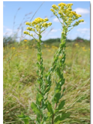
Leaves are consecutively smaller as they extend up the stem

The rigid stems of stiff goldenrod extend upright to around four or five feet tall. The stems are covered with downy hairs and support terminal, flat-topped groupings of flowers. The bright yellow composite flowers bloom in late summer into the fall and produce fluffy seeds that are wind dispersed. The plant's basal leaves can be large, up to ten-inches long, downy and usually lack any serrations. The leaves that extend up the stem are alternate and tend to be smaller towards the top of the stem. Leaves on the upper portion of the plant are oval shaped and lack teeth.