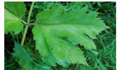
Leaves can be up to two feet wide.