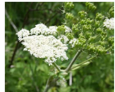
Large flower umbel composed of tiny flowers.