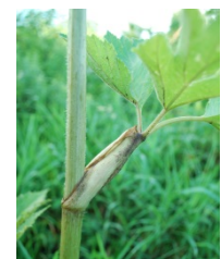
Clasping leaf stalk