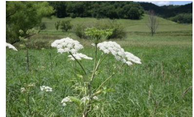
Cow parsnip often stands high above other plants in wet habitats.

With a height up to eight feet tall, leaves up to two-feet wide and with a bright white inflorescence, cow parsnip can be easy to spot in the landscape. Its stems have ridges and are hollow with small downy hairs. The leaves are typically three parted with enlarged bases that clasp the stem. Many small flowers with five deeply notched petals are grouped in 4-8 inch wide flat-topped umbels. The flowers are often larger on the edge of the umbel and bloom in June and July. The flowers develop into large winged seeds that separate into two seeds as they dry. Giant hogweed, an invasive species not currently in Minnesota is also in the genus Heracleum . It grows up to 15-feet tall and has leaves up to 5-feet wide and can cause severe blistering and scarring. See the comparison of carrot family species that grow in moist areas on the second page.