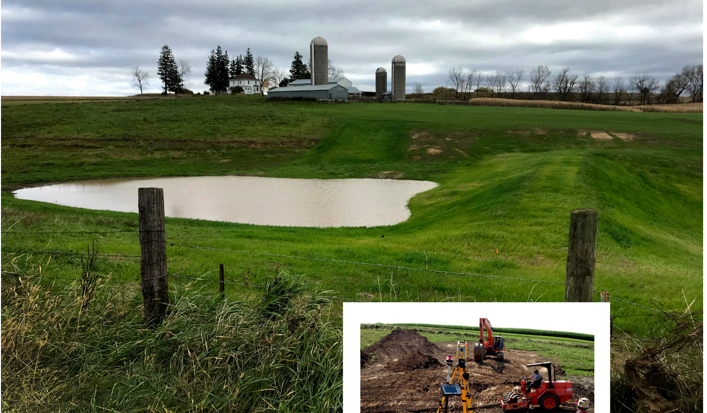
At the Winona County SWCD, local capacity funds boost all 3. A new hire promotes cover crops; conservation multiplies with cost-share.