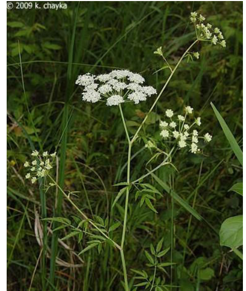
Left: Cow parsnip ( Heracleum maximum ) has palmately compound leaves and flowers with notched petals. Photo Credit: Dave Hanson Center: Poison hemlock ( Conium maculatum ) (deadly) has finely divided, fern-like leaves. Photo Credit: Katy Chayka, Minnesota Wildflowers Right: Common water-hemlock, ( Cicuta maculata ) (deadly) has narrower leaves, smaller and more slender stature, and a flat (rather than spherical) flower cluster. Photo Credit: Katy Chayka, Minnesota Wildflowers