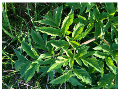
Lower leaves are up to 2 feet long with three to five leaflets.

The greenish flowers occur in rounded clusters (umbellets) that are grouped into rounded umbels 4 to 8 inches wide. The 6- to 9-foot-tall stems are hollow, smooth and purple or streaked with purple. Leaves are alternate and compound. The elongated leaf stalks have a large green-to-purple sheath at the base. Lower leaves, with three to five leaflets, measure up to 2 feet long including the long petioles. Upper leaves are smaller, less compound and on shorter petioles. Leaflets are up to 4 inches long and ovate to lance-shaped, sometimes with