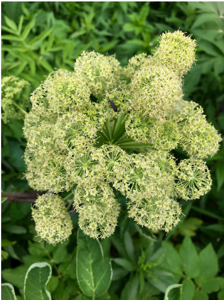
The green flowers form a large rounded umbel composed of smaller rounded umbellets.